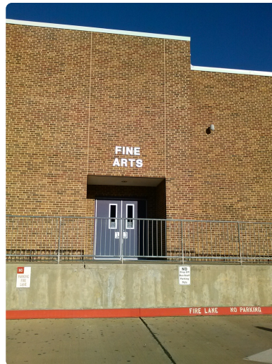
Concert/chamber enter here. Orchestra room will be to the left. Stage is down the hall to the right.