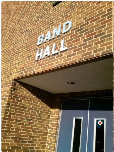
Philharmonic enter here, warm up is just inside