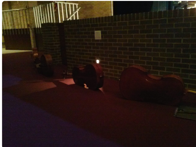
Cellos on their sides, bows stay with musicians