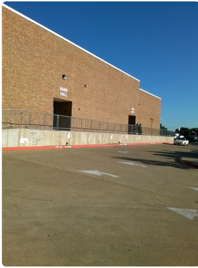
Enter Here off Dogwood

Location: Richardson HS , 1250 W. West Beltline (enter off Dogwood, just North of Belt Line) YOU are responsible for getting a ride to RHS. Presidents/VP's can help you find someone to carpool with so plan ahead.